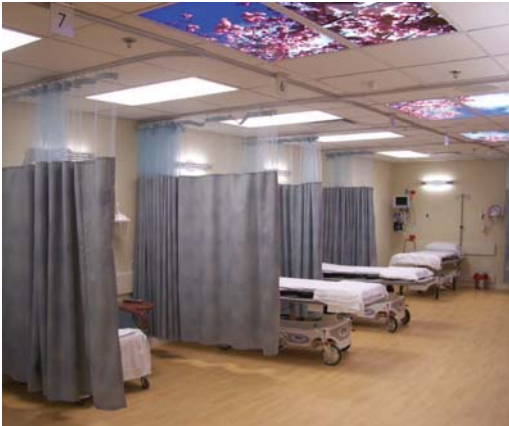
Surgery Recovery Room

The addition of a street-level glass entry transforms the exterior into something worth noticing and sets the tone for the space below. Upon