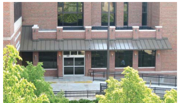
New Pedestrian Entrance