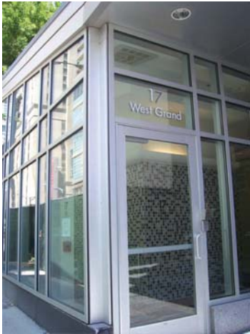
New Glass Entry at Street-Level

To see more photos of this facility, visit www.grandavenuesurgicalcenter.com